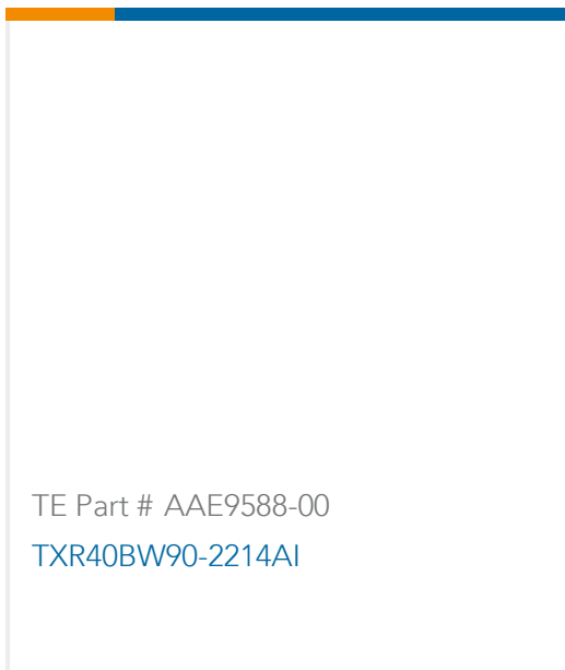
TE Part # AAE9588-00 TXR40BW90-2214AI