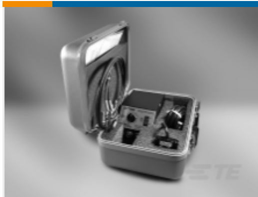
TE Part # 173643-000 RH-3960-1-TINEL-KIT-120V