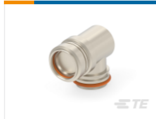
TE Part # EP4595-000 TXR15AZ90-1214AI